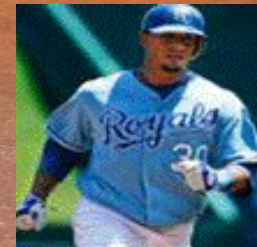
Major League SS of KC Royals