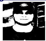
OF Director- 2005 All-American