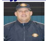
Catching Director- Cubs