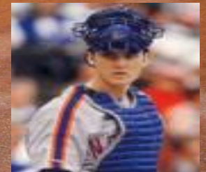
11 Year Veteran MLB Catcher