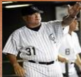
Former Manager Colorado Rockies