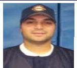
Pitching Director- Minnesota