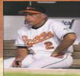
3B & Infield coach Philadelphia