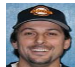
IF Director- Cleveland