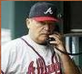
Legendary Atlanta Pitching Coach